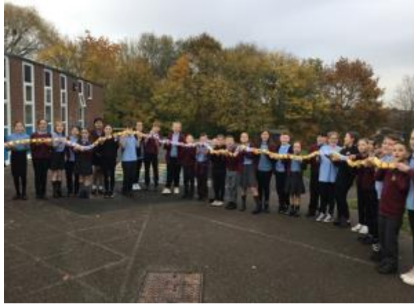
1 - Year 6 made a kindness chain by linking kind words together, they were very proud of it.