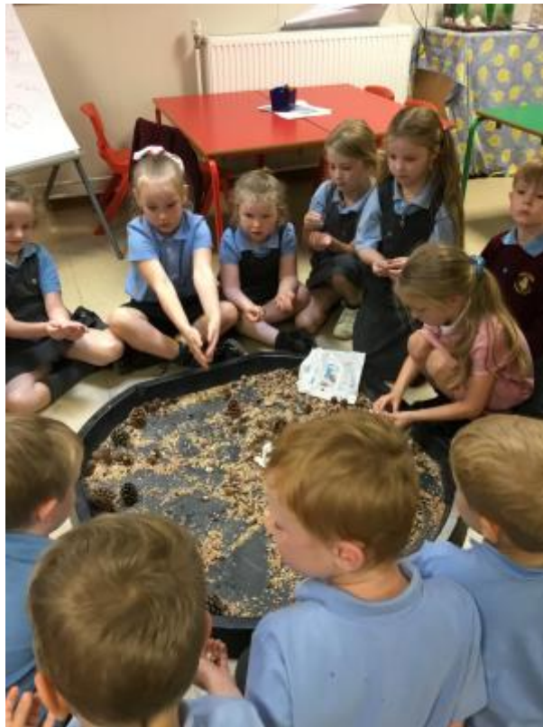
Early Years Newsletter 24.9.2021