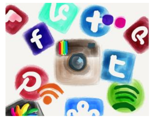
1 - <u>https://www.birdsbush.staffs.sch.uk/wp-content/uploads/2021/05/internet-issue-letter.pdf</u>

IMPORTANT INFORMATION - The letter sent out on 6th May regarding Social media and chat can be read here. Please help us help your children understand how to use social media responsibly.