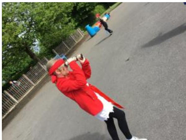
1 - Year 4

Year 4 loved their 'Fabulous Finish' dress up day on Wednesday. Dressing as such fearsome pirates was the perfect inspiration for Big Write! It was wonderful to hear the children using their geographical knowledge to describe an island.