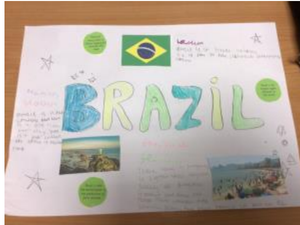
2 - We have been learning about Brazil, we created posters with all of our new knowledge

We organise our learning in school into blocks or units so that children get a cross curricular experience to learn skills and knowledge and apply them in a range of contexts. Each unit starts with a " Stunning Start " and is celebrated at the end of the unit with a " Fabulous Finish ". Classes will have different plans for their fabulous finish. Information for the class will be on the newsletter and clearly says which class it is for. Please never feel pressured to buy costumes or props for any event in school, homemade or normal uniform is fine - children will be able to join in regardless.