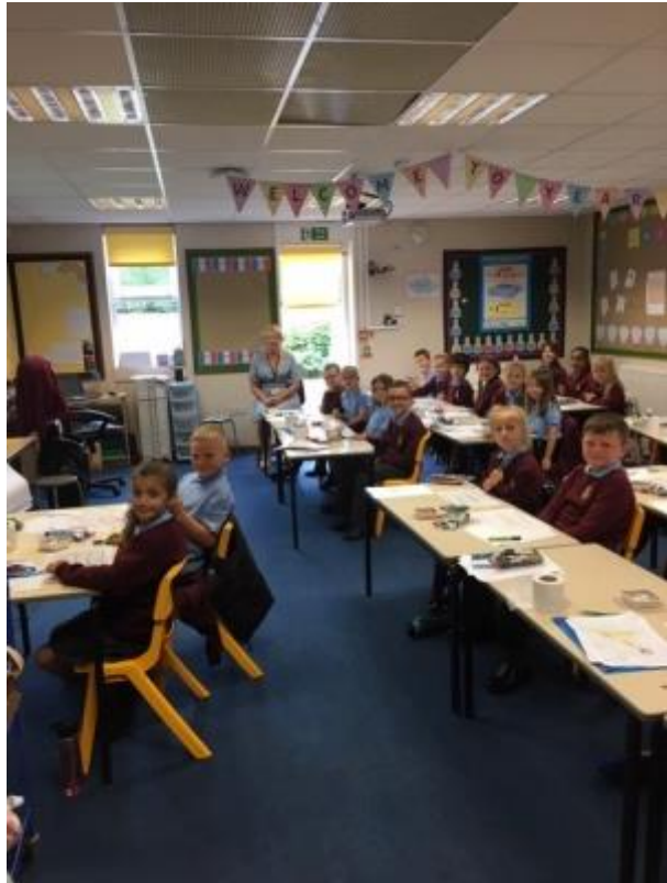
7 - year 5