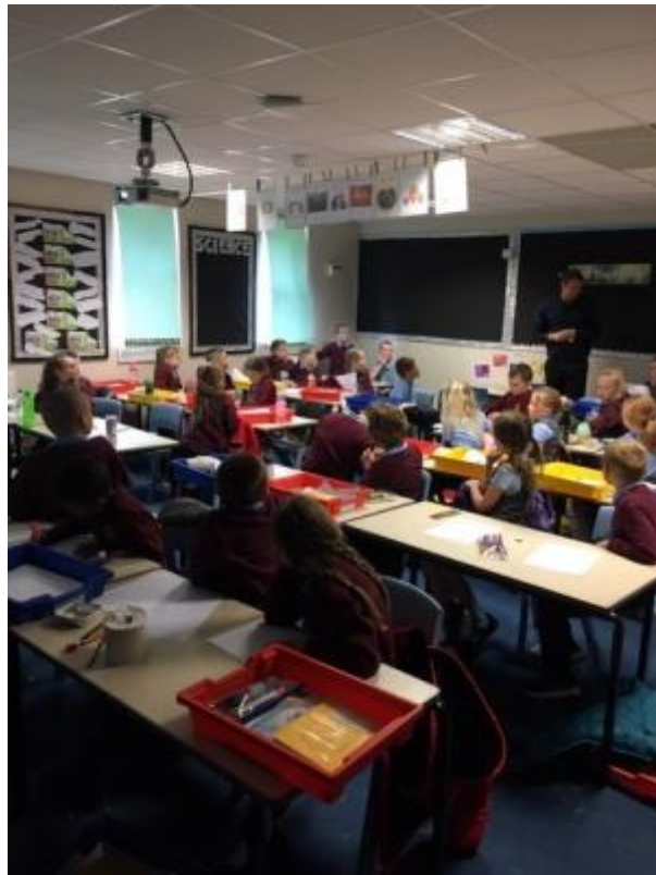
6 - Year 3