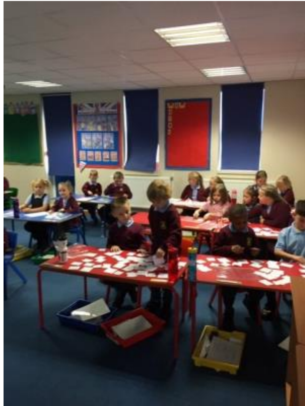
5 - Year 2