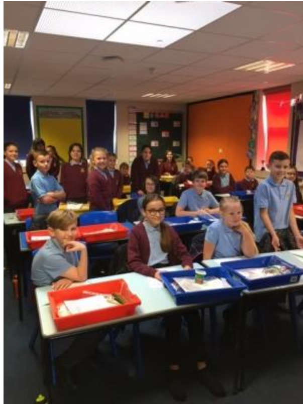
1 - Year 6