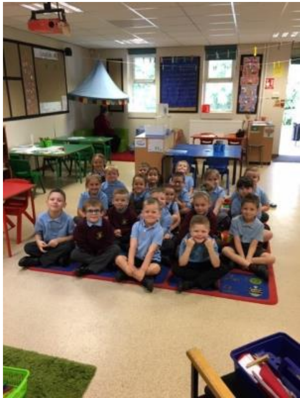
8 - Year 1