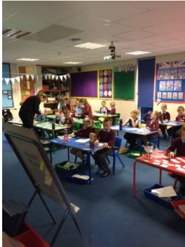
3 - Year 2