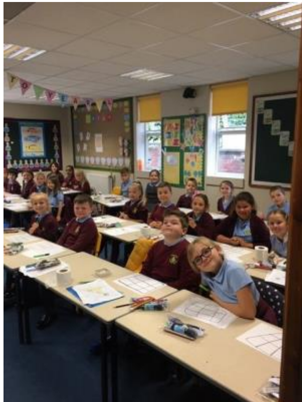
2 - Year 4