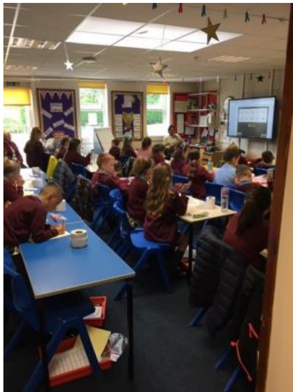
4 - Year 5