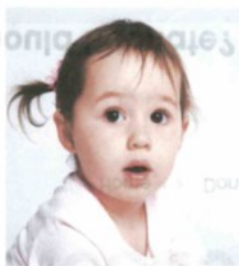
Baby / Child

Sanitary pads & tampons, shampoo & conditioner, hair styling products, face wash, cleanser & creams, body wash, body lotion, deodorant, toothpaste & toothbrush, disposable razors, nail files, make-up, perfume, gift sets