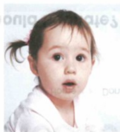
Baby / Child

Sanitary pads & tampons, shampoo & conditioner, hair styling products, face wash, cleanser & creams, body wash, body lotion, deodorant, toothpaste & toothbrush, disposable razors, nail files, make-up, perfume, gift sets